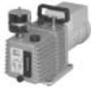
8890A (see note 3)